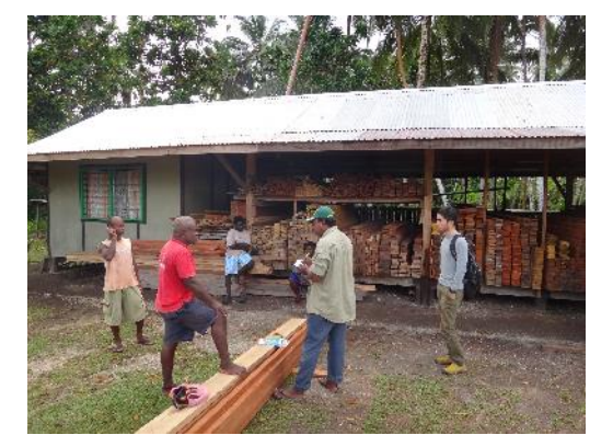
Plate 3 Example of MOFR conducting monitoring inspection of local timber supplier