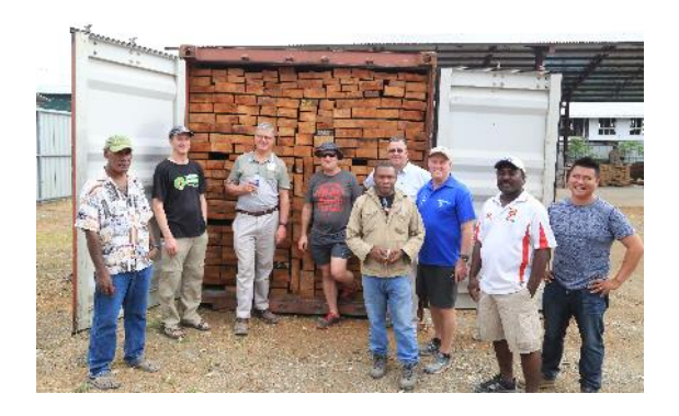
Plate 4 Timber ready for export at VATA yard

The visit was the first such industry-level engagement between Solomon Islands and New Zealand, along with key stakeholders, including MOFR. It was a valuable opportunity to ensure broad understanding among the Solomon Islands industry of New Zealand market requirements and to establish an agreed platform for work to progress timber legality assurance and forest management certification in Solomon Islands. The visit was also an opportunity to consider technical exchanges between the industries, with the intent of improving Solomon Islands timber processing and product quality, as well as progressing individual business relationships.