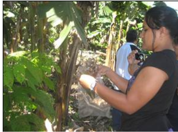
Collecting banana samples (STEC)