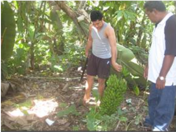
Collecting banana samples (Afega)