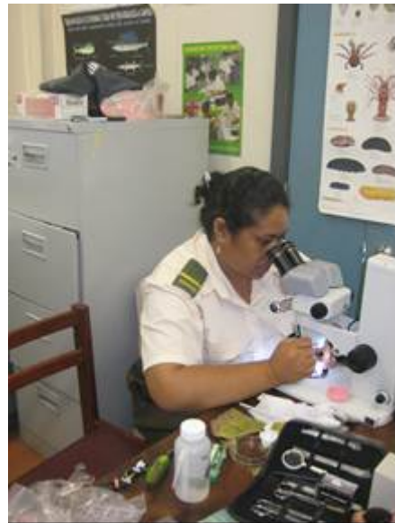
Identifying pests (SQS wharf office)