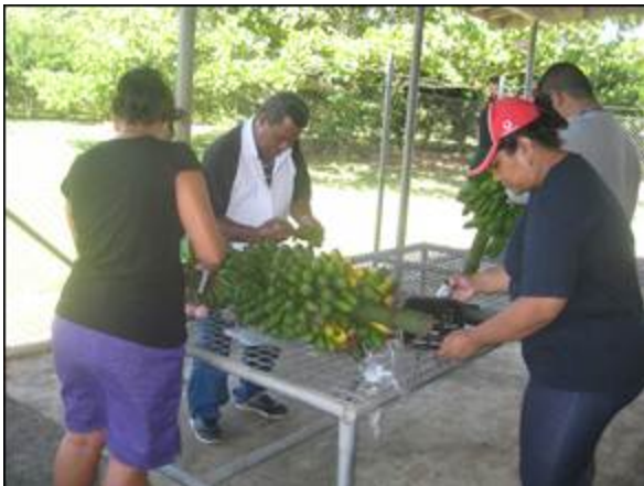
Collecting pests (Atele research station)