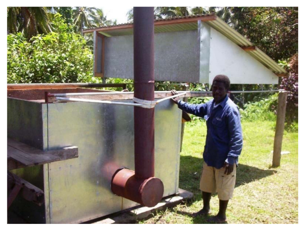
Plate 5-1 Mini-dryer used in Solomon Islands for cocoa drying