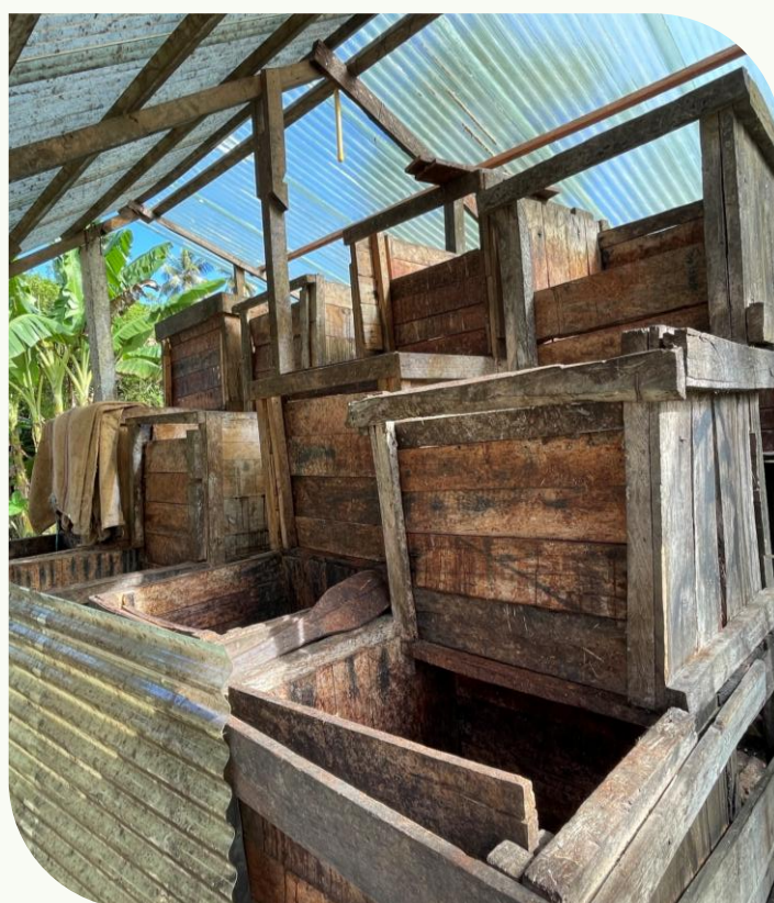
Photo: Cascading cocoa bean fermentation boxes developed with and for a farmer with physical disabilities to enable him to perform his duties efficiently and effectively.

Gaston Chocolat’s advice to other businesses: inclusion isn’t a cost — it’s a foundation for impact, satisfaction, and shared growth.